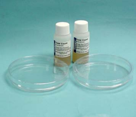
Includes 10 Petri Dishes Re-Order using Item # PT-009T